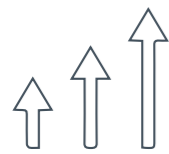
Increased pressure ulcers